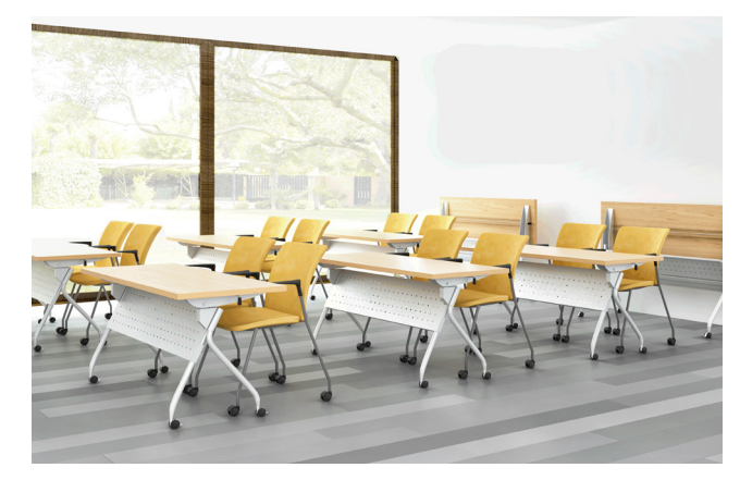
Flip & Nest Tables