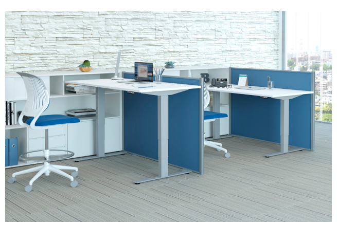
Height Adjustable Tables